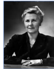
"First Lady" of Al Anon

Sunday, May 17, 2026 Potluck @ 5 PM Showing of "Lois's Story" @ 6 PM