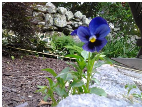
Service (planting the seed) - Recovery blooms.

Alternate Area Delegate - The Delegate attends the annual Al-Anon/Alateen World Service Conference (our world-wide group conscience) and brings to the Conference our Area's viewpoint on matters affecting the entire fellowship. The Delegate then returns to the Area with a broader perspective of Al-Anon worldwide. He/she is the bridge of understanding that links the groups in the Area with world Al-Anon/Alateen to help us continue to function in unity. The Delegate is the servant of Al-Anon as a whole.